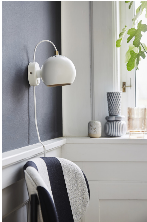
BALL MAGNET WALL LAMP MATT WHITE / ANNIVERSARY MODEL DESIGN: BENNY FRANSEN