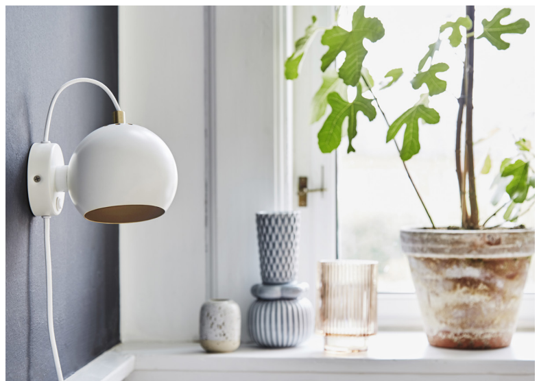
BALL MAGNET WALL LAMP MATT WHITE / ANNIVERSARY MODEL DESIGN: BENNY FRANSEN