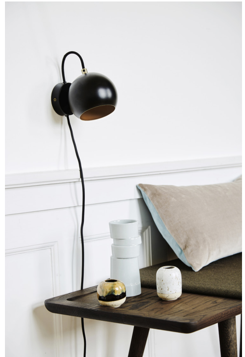
BALL MAGNET WALL LAMP MATT BLACK / ANNIVERSARY MODEL DESIGN: BENNY FRANSEN